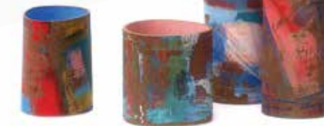
Magdalena DMOWSKA, Mindscapes III , stoneware ceramic, plaster monoprint, slips, underglazes, oxides, dimensions variable