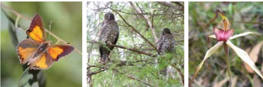
LEFT TO RIGHT Eltham Copper Butterfly ( Paralucia pyrodiscus lucida ), Powerful Owl ( Nixon strenua ) and the Wine-Lipped Spider Orchid ( Caladenia oenochila ).