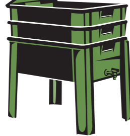
Worm Farm: food waste only