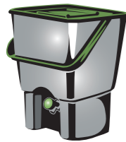
Bokashi System: food waste only