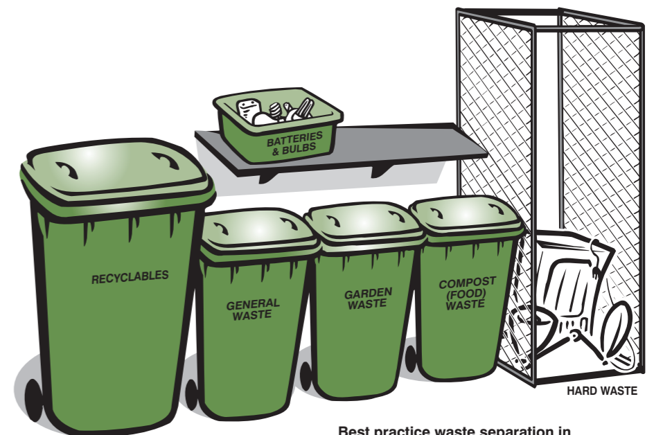
Best practice waste separation in multi-unit residential developments.

Construction sites can represent a great burden on local waterways. Site litter, paint, solvents, bricks, cleaning substances and clean-fill can all contaminate stormwater runoff. It is an offence under the Environment Protection Act to discharge contaminated water into the stormwater system. To avoid contamination, ensure that a drainage system is installed before construction activities commence and storm water is diverted from areas where soil is exposed.