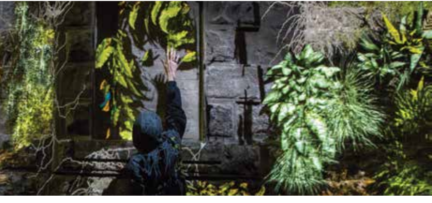
ABOVE: Yandell WALTON. Human Effect. 2012. Interactive projection installation.

Visit montsalvat.com.au to find out more.