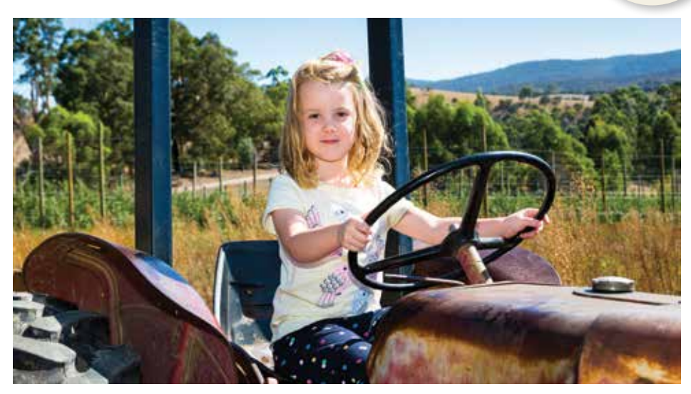
Open Farm Day visitors will be able to see what farm life is like.