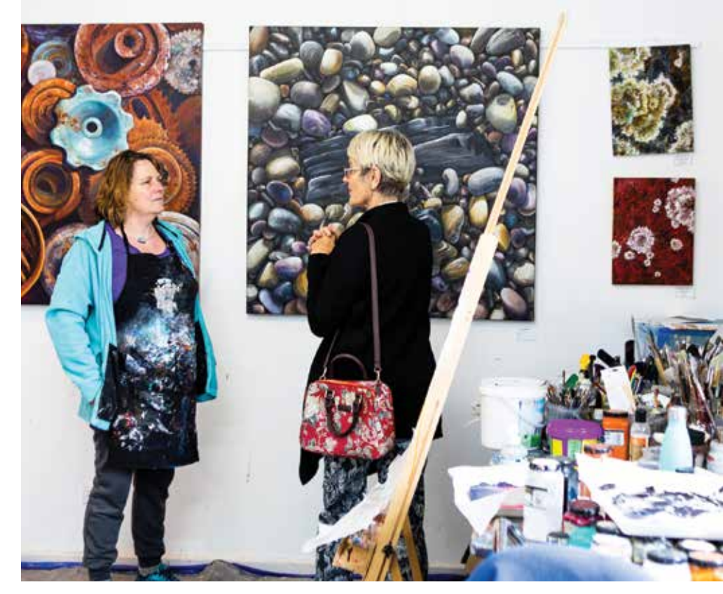
See demonstrations, buy unique artwork and sign up for courses at the open studios weekend.