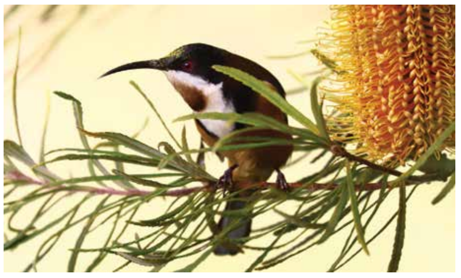
A spinebill, a member of the honeyeater family, in a Nillumbik garden.