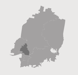
Ellis Ward covers Diamond Creek and surrounds.

Stay safe and keep supporting each other.