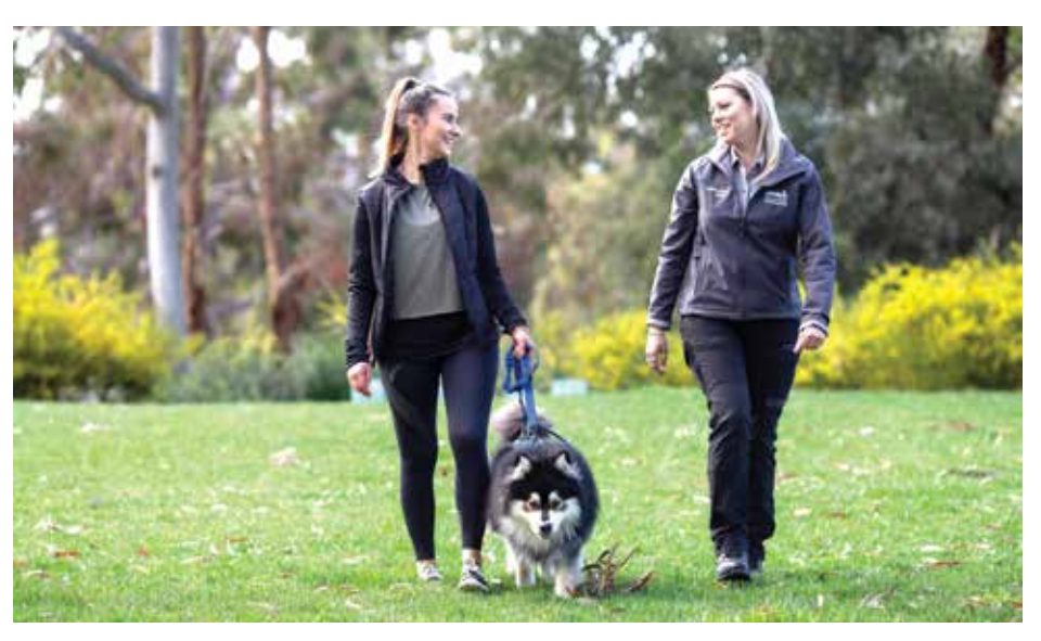
Local laws, including those covering animals, will be reviewed this year.

You can view the new policy at: nillumbik.vic.gov.au/strategies