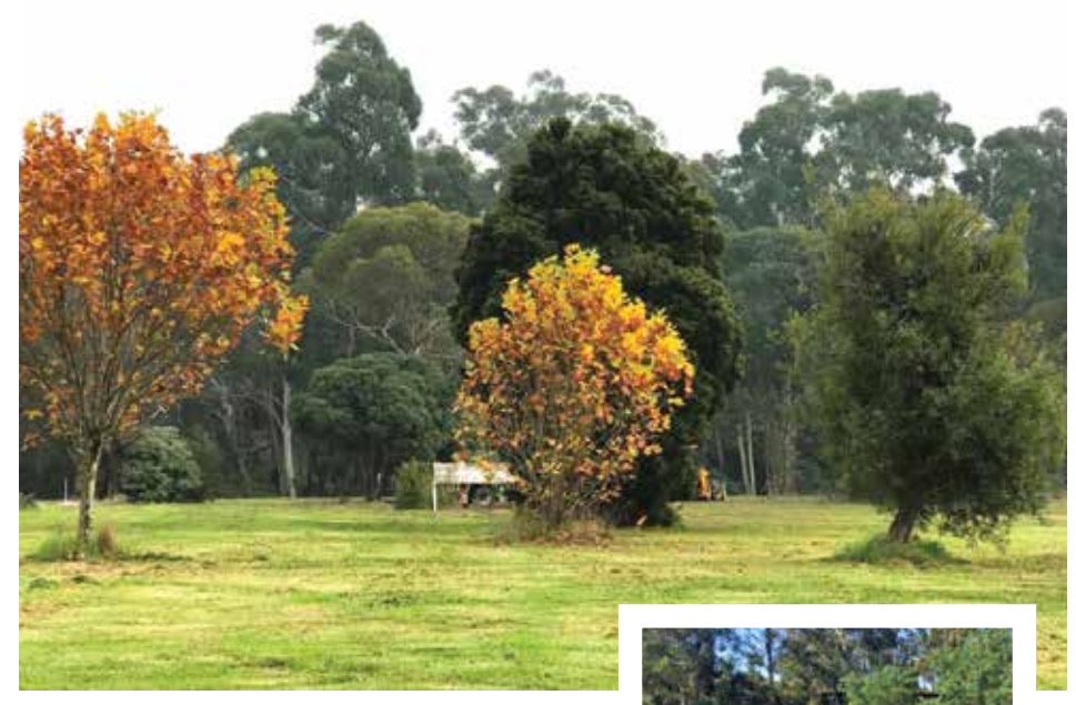
The Graysharps Road precinct will be revitalised while (inset) work is almost finished on the Diamond Creek Train