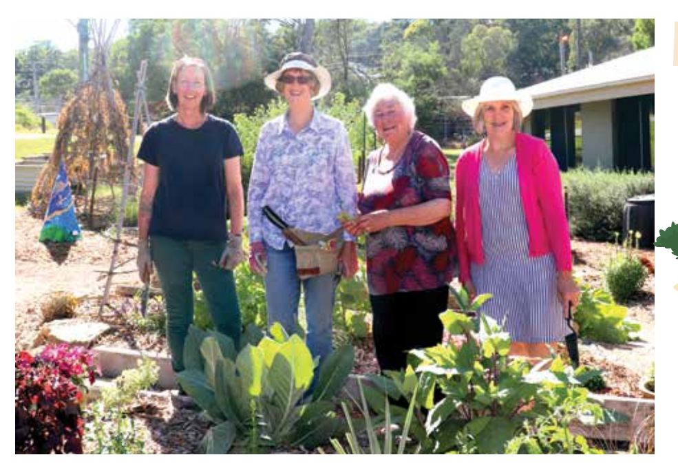
Volunteers tend to the Edible Hub Community Garden in Hurstbridge