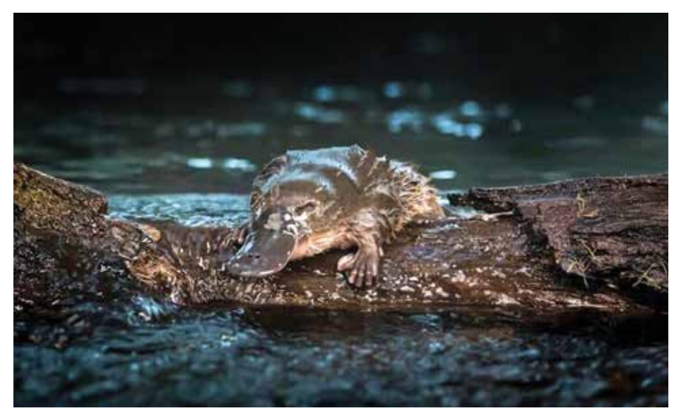
Find out more about the elusive platypus.

Information: 9433 3138 or agedcare@nillumbik.vic.gov.au