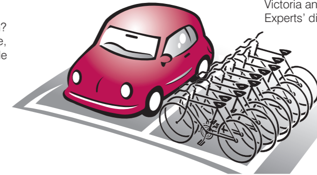
One car space can usually be converted to 10 to 14 bike parking spaces.