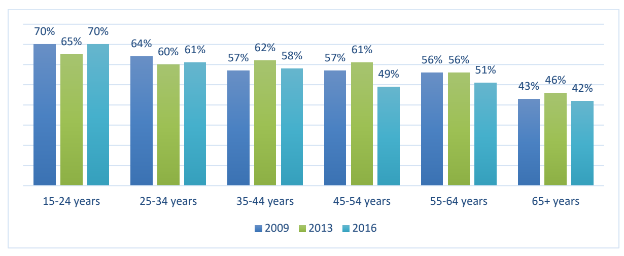
Figure 4 Australians attendance at music events and activities<sup>3</sup>