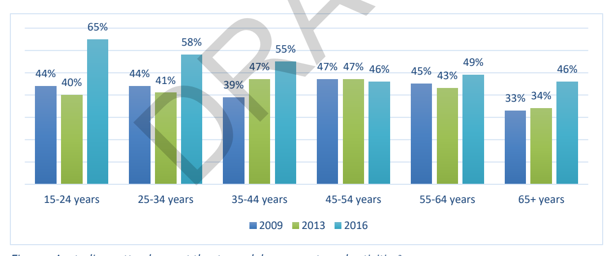
Figure 3 Australians attendance at theatre and dance events and activities<sup>2</sup>