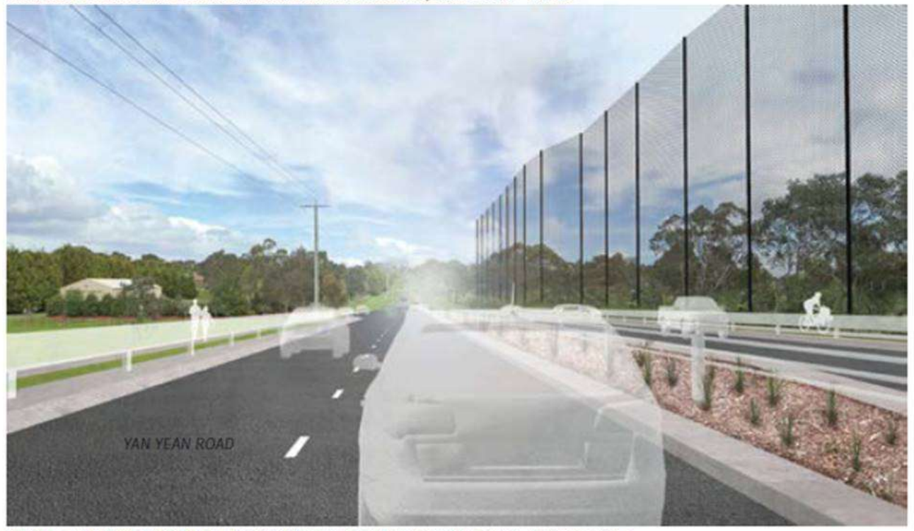
FIGURE 5.46: VIEWPOINT C - YAN YEAN ROAD ALONGSIDE YARRAMBAT GOLF COURSE, LOOKING SOUTH - PROPOSED - YEAR 1 NOTE: DESIGN IS FOR ILLUSTRATIVE PURPOSES ONLY AND SUBJECT TO CHANGE