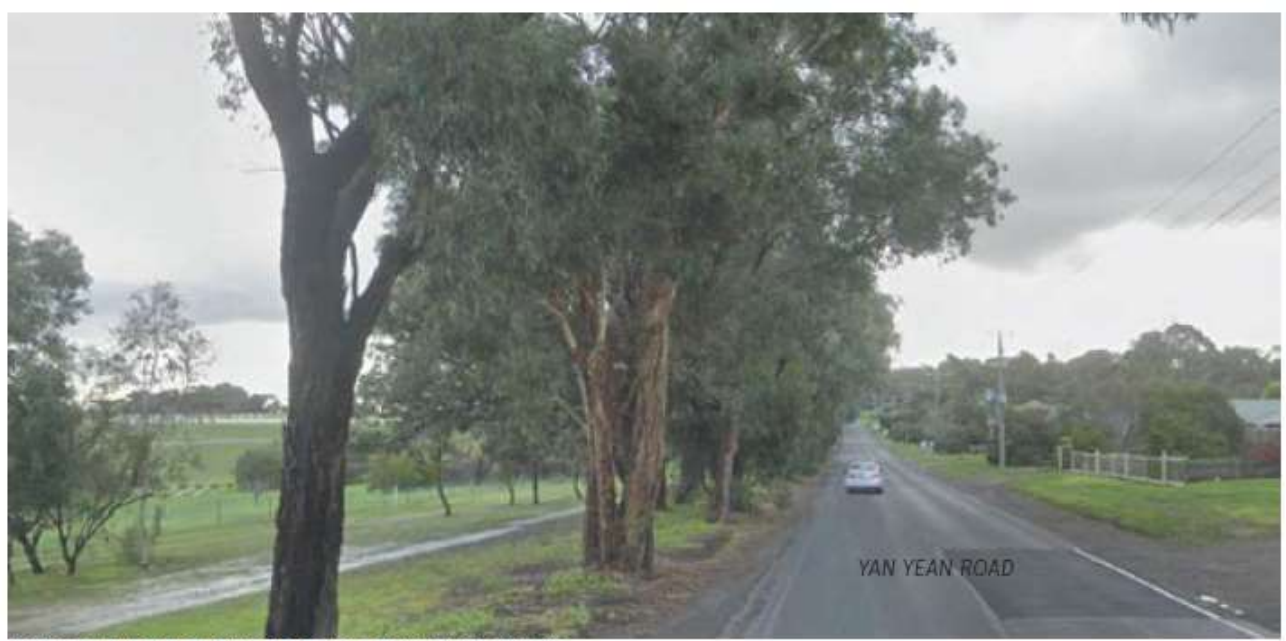
FIGURE 5.41: VIEWPOINT D -YAN YEAN ROAD, NEAR BANNONS LANE - EXISTING