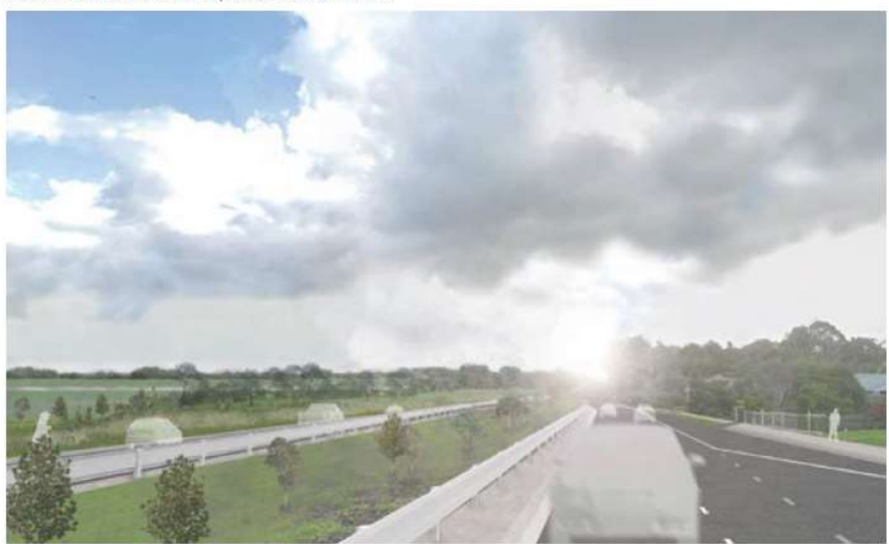
FIGURE 5.42: VIEWPOINT D - YAN YEAN ROAD, NEAR BANNONS LANE - PROPOSED - YEAR 1 NOTE: DESIGN IS FOR ILLUSTRATIVE PURPOSES ONLY AND SUBJECT TO CHANGE