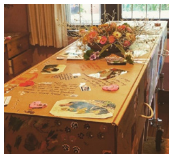
Cardboard coffin, lovingly decorated by the family.

A funeral or memorial can take any format you want. Serve drinks on arrival! Have the person's favourite music playing as people arrive. Let people sign or write on the cardboard coffin. There are no limits or formats you have to follow.