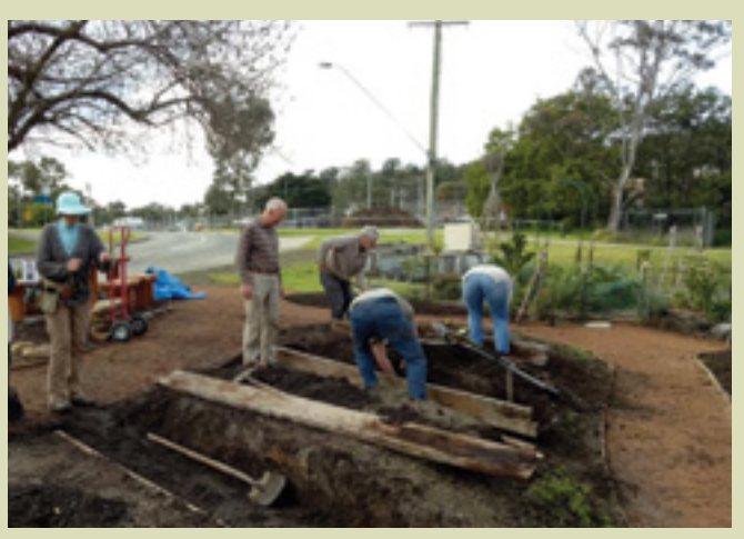
Creating new beds at the Hurstbridge Edible Hub.

If I take the issue of food production, we need to care about what we eat, where it comes from, and consider if its production is harming or helping the planet. How far does it travel before it gets to our table? We need to treat the Earth's resources as precious and rare. I do what I can in my small corner of the world and hope that others are doing the same in their small corners and together we can be the way forward to a fairer, greener future.