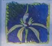
Green-ramb spider orchid Calochortis alpinus