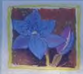
Spotted stem orchid Phlogothria caerulea