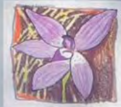
Wax-tip orchid Calochortis alpinus