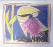
Purple-lipped orchid Calochortis alpinus