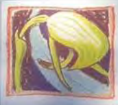
Redding green orchid Phlogothria alpinus