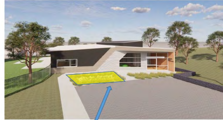
Proposed artwork location