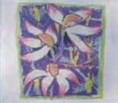
Musky caladenia Caladenia gracilis