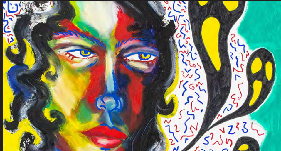
Image: Chloe Vallance, Music (detail), 2021, colour pencil on plywood, 29.5 x 35cm

Sit. Walk. Wonder explores studio-based drawings by local artist Chloe Vallance. Chloe's works are developed by observing everyday activities of people and animals. Chloe is interested in moments of contemplation. Often the figures in her works are seen to be looking into the middle distance, pausing or walking, each on their own journey.