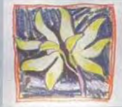
Early caladenia Caladenia praecox