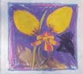
Wallflower orchid Dieris carolinensis