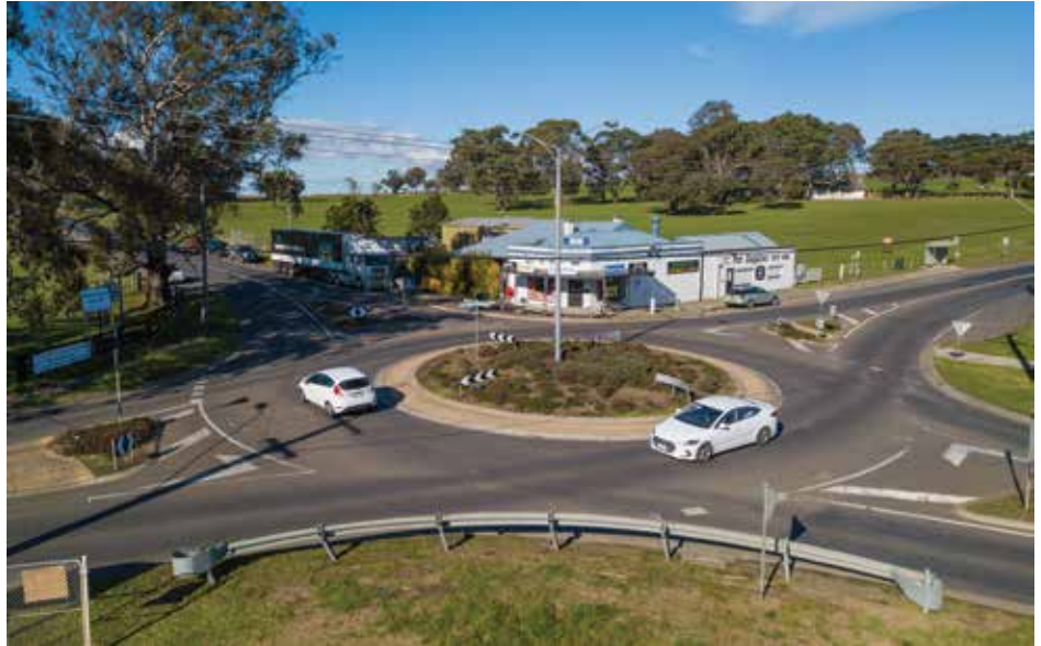
The intersection of Yan Yean and Bridge Inn roads.

For more information about registering your pool or spa in Nillumbik, visit nillumbik.vic.gov.au/pools-and-spas