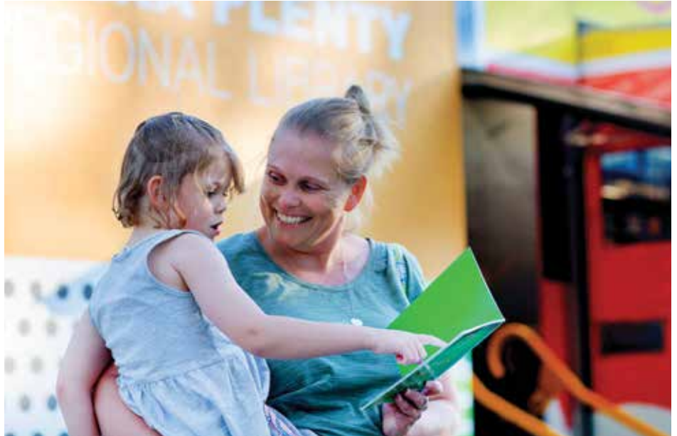
Yarra Plenty Regional Library's mobile library service will be back on the road once COVID-19 restrictions allow.

See video highlights at nillumbik.vic.gov.au/digital-storytelling