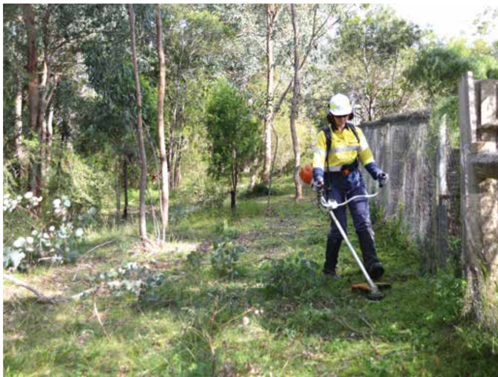
Brush cutting in one of the Eltham Copper Butterfly reserves.

For more information on our works program and to view our Bushfire Mitigation Strategy, go to nillumbik.vic.gov.au/bushfire-mitigation