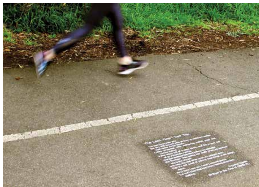
Short texts were stencilled on paths around the Shire as part of Written in the Time of COVID-19.

nillumbik.vic.gov.au/grants nillumbik.vic.gov.au/covid-art