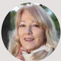
Cr Karen Egan Mayor