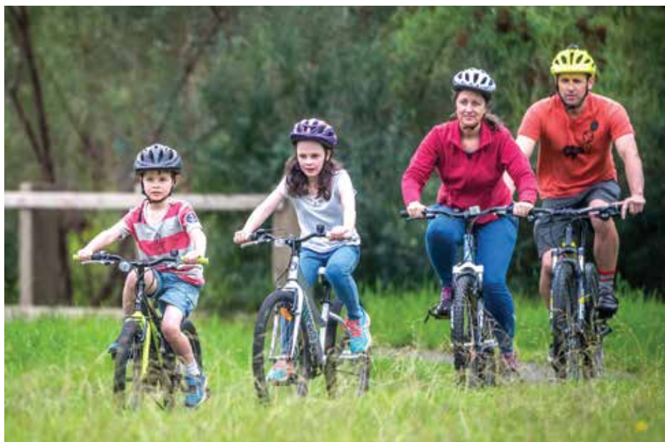
Nillumbik's trails have been popular during the COVID-19 restrictions.

For more information go to participate.nillumbik.vic.gov.au/solar-farm or email solar.farm@nillumbik.vic.gov.au