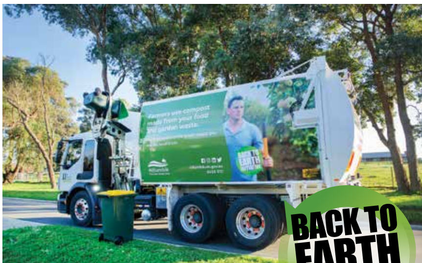
One of the new waste collection trucks.

For more information and to upsize your green waste bin online, go to nillumbik.vic.gov.au/bins . To order a new landfill bin or for all other options, contact customer service on 9433 3111.