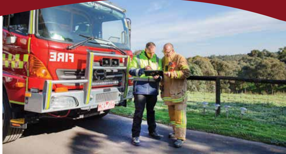
Working with the community and stakeholders is key to bushfire preparedness.