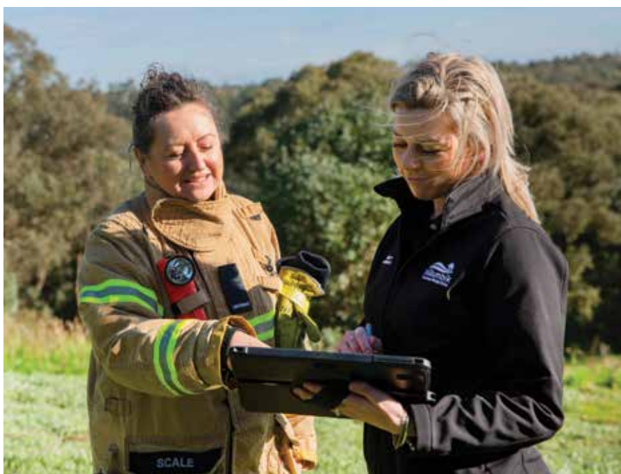
Council officers work with emergency services and the community to prepare for bushfire.

Go to cfa.vic.gov.au for more information.