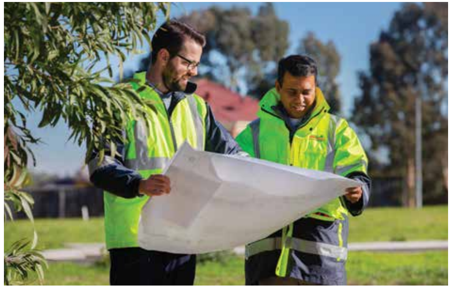
The 2020-21 Budget has $35.8 million in capital works projects.