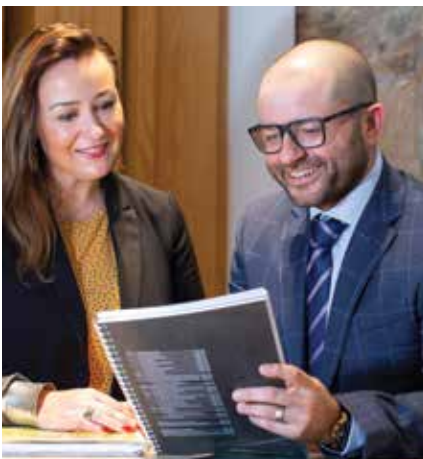
The Better Business Approvals project is making it easier for small businesses to open their doors in Nillumbik.

For more information on the EES and to register to be notified when the EES goes on exhibition, go to roadprojects.vic.gov.au/yyr-ees . You can also request an EES information pack by emailing contact@roadprojects.vic.gov.au or calling 1800 105 105.